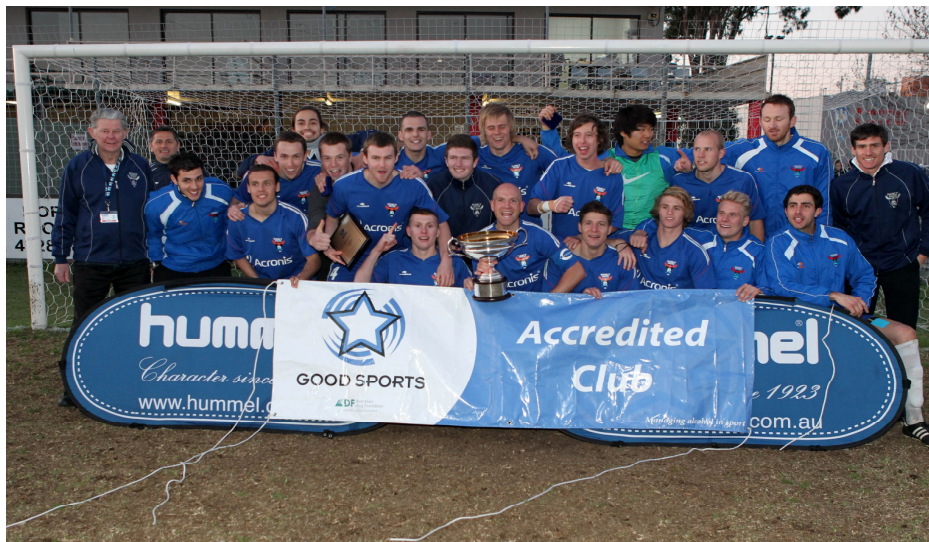
Manly United show off their Good Sports merchandise after winning the Waratah Cup

Please contact your Good Sports Project Officer if you have any merchandise related issues.